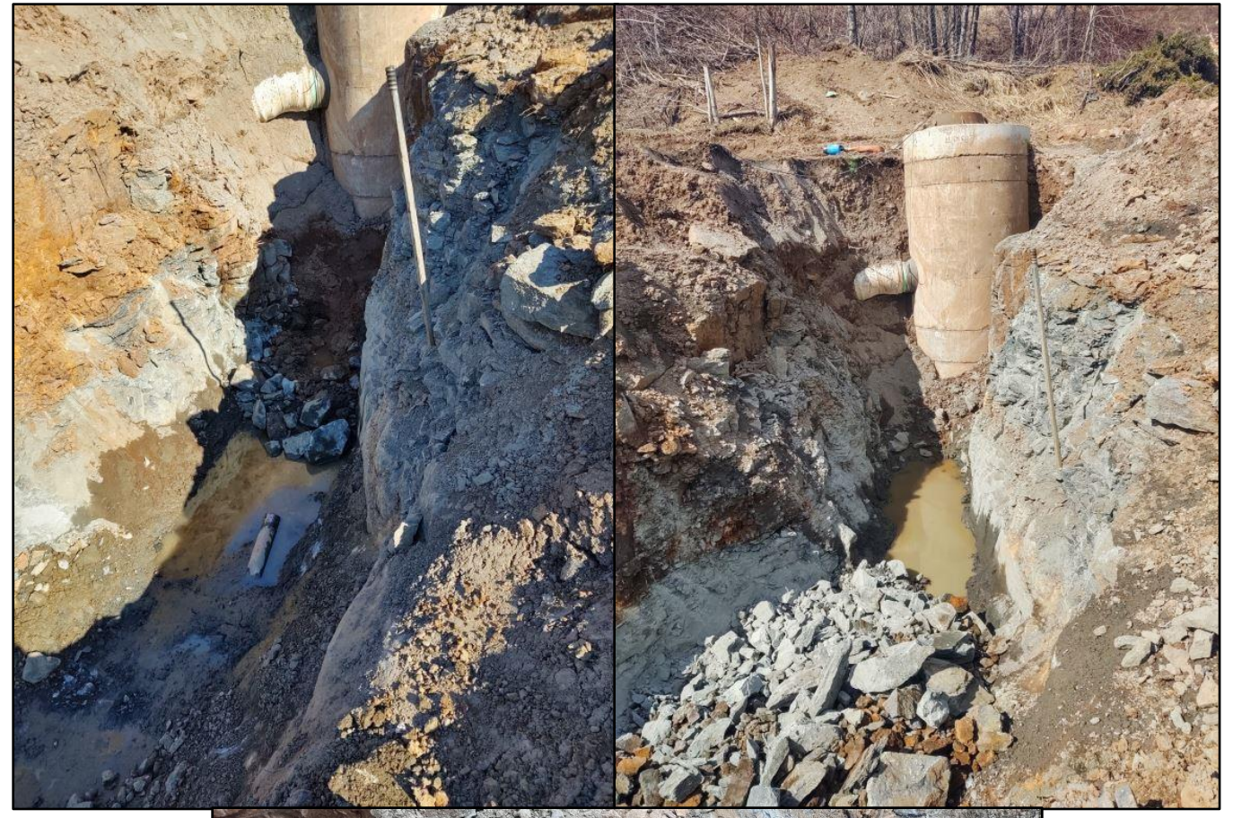
Pretreatment Rock Excavation for Future Influent Pipe

Name:City of Silver BayDate:April 28, 2020Page:2