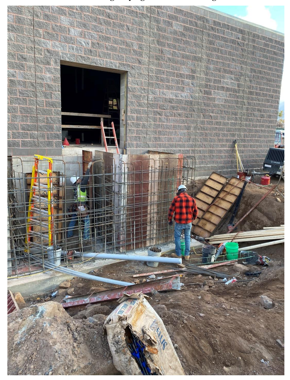
Pretreatment Building - Tying Rebar for Loading Dock Walls