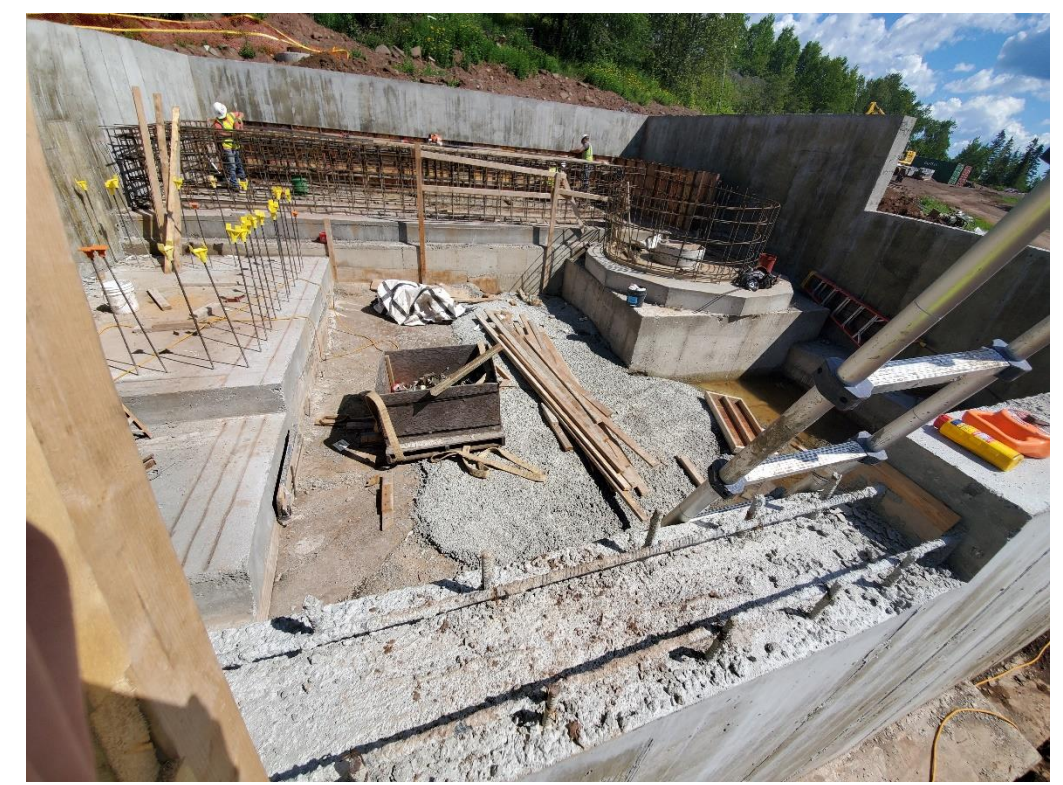
Pretreatment Building – Construction Progress

Name: City of Silver Bay Date: July 29, 2020 Page: 2