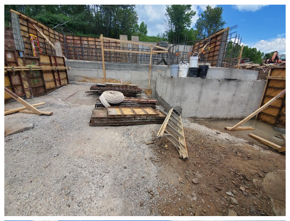
Pretreatment Building – Foundation and Walls Partial Construction

We continue to meet with the contractor on-site and by phone to ensure the work is completed in accordance with the contract documents and in the best interest of the City. According to the contractor's anticipated schedule, the project is on schedule.