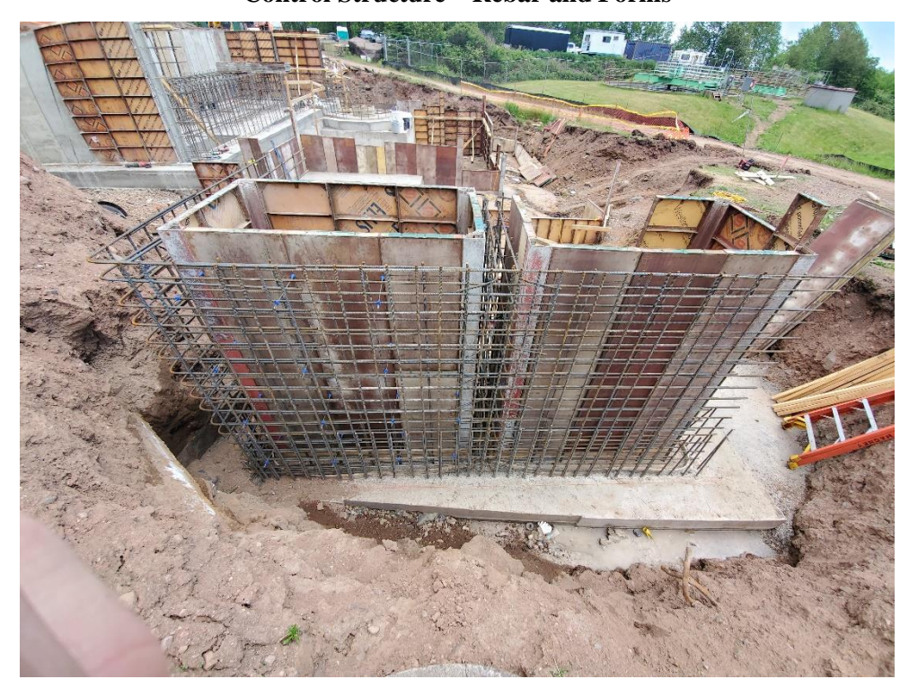
Control Structure – Rebar and Forms

Name: City of Silver Bay Date: June 29, 2020 Page: 4